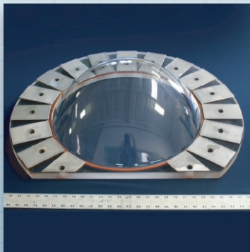
1m Demil Camera Dome