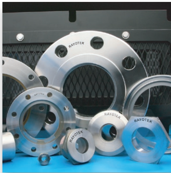
Flanged & Threaded Sight Windows