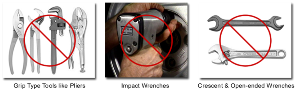
Figure 2: Unapproved Installation Tools

Figure 2 shows unacceptable installation tools. Using one of these tools can damage your sight window and will void the warranty.