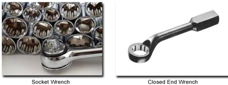
Figure 1: Approved Installation Tools

Threaded sight windows must be installed with closed-end wrenches or sockets. Figure 1 shows acceptable installation tools.